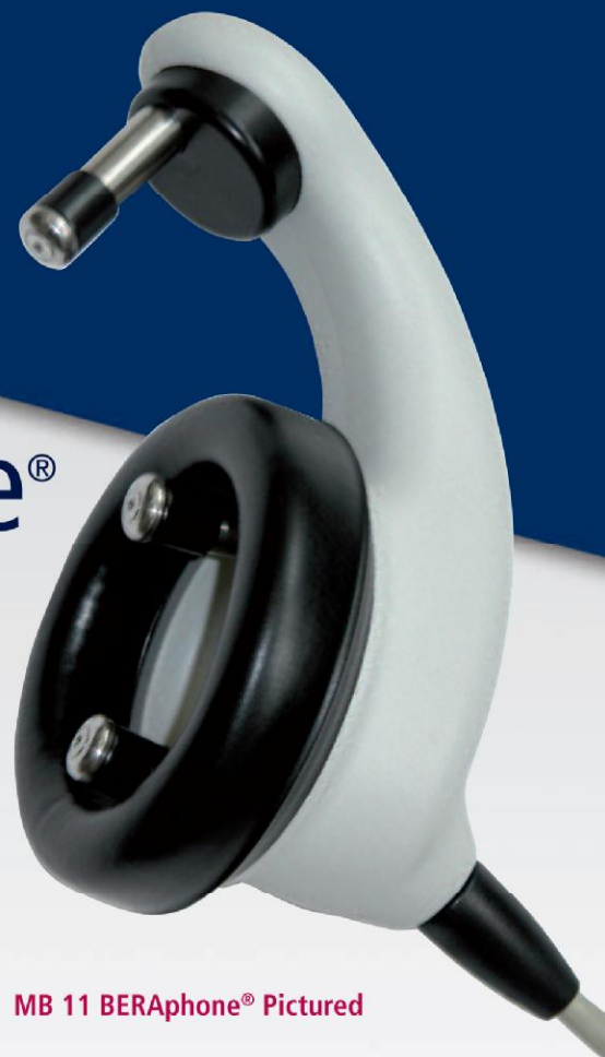
MB 11 BERAphone® Pictured

No costly disposables and so easy to use.