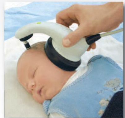
Position the MB 11 BERAphone®, surrounding the baby's ear with the earphone and resting the electrodes on the prepared sites