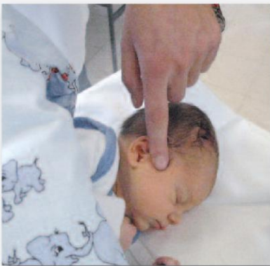
Apply electrode gel at the 3 electrode sites on the baby's head