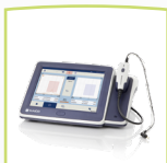
touchTymp with printer