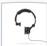
DD45 C (Tympometry)