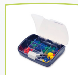
Ear tip kit